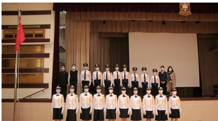
Group photo of the principal, school chaplain, assistant principal, teacher and Flag-guards

The Flag-guards promote the school's flag-raising culture, allowing students and teachers to get to know the country, care about the motherland, and enhance their national identity through personal participation.