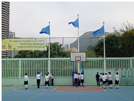
Practice the flag raising ceremony and master the time