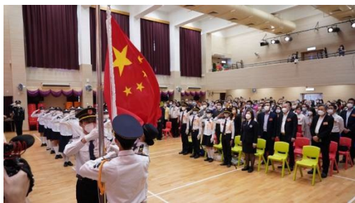
Participated in the flag-raising ceremony of the July 1st Celebration of the Return of Hong Kong. The ceremony was solemn.