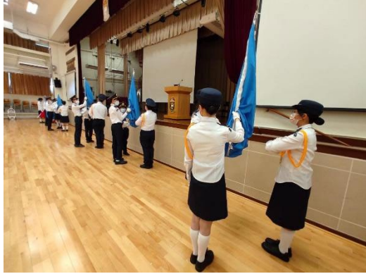
All the flag-guards earnestly practice the flag raising ceremony together