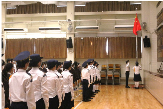
All flag-guards are in tidy uniform