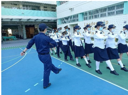
Training the goose steps of Chinese foot drill