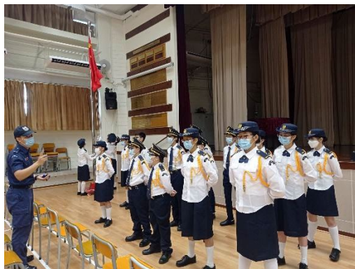
Flag-guards work hard to learn the details of each step