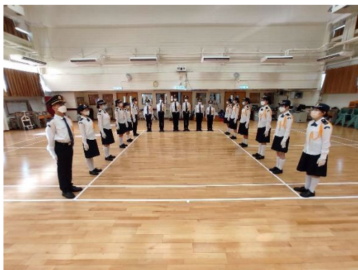
Rigorous Attitude and Uniform Inspection

The flag-guards have strict morning training every week to cultivate students' spirit of punctuality, responsibility and discipline, and also let students understand the flag-raising culture and respect for the national flag, so as to establish a correct patriotic attitude.