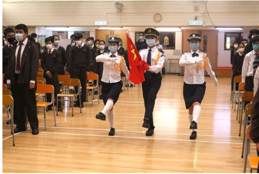
Enter solemnly with Chinese foot drill

Through the flag-raising ceremony, students can improve their national identity and enhance their national concept, which is an important learning content of national education.