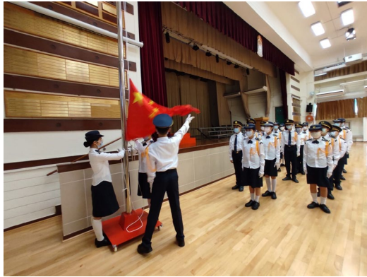
The moment of raising the flag and the phalanx of flag-guards