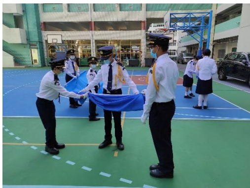
Learn intricate and complex flag folding