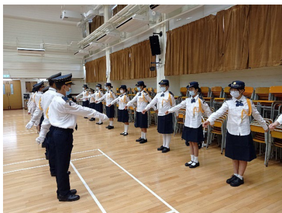
Flag-guards study the details of hand movements carefully