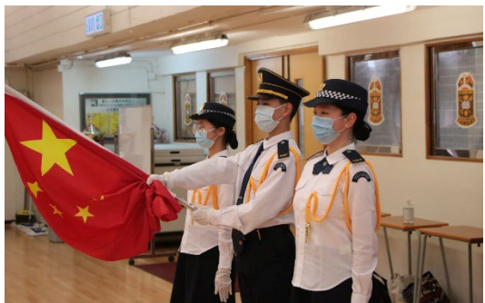
The flag-guards are ready for the match in